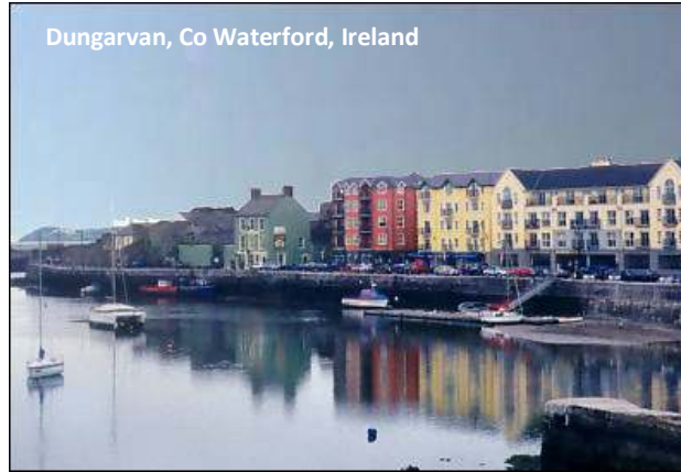
Dungarvan, Co Waterford, Ireland

No refunds will be made in respect of non-attendance without prior cancellation.