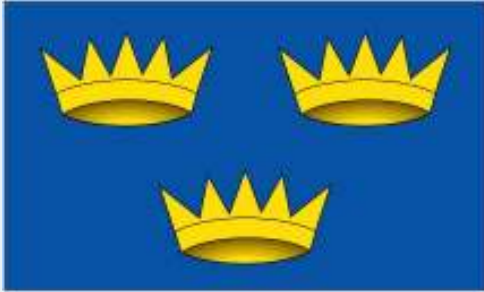
Munster Province Emblem