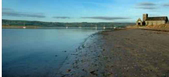
The Abbey, Dungarvan